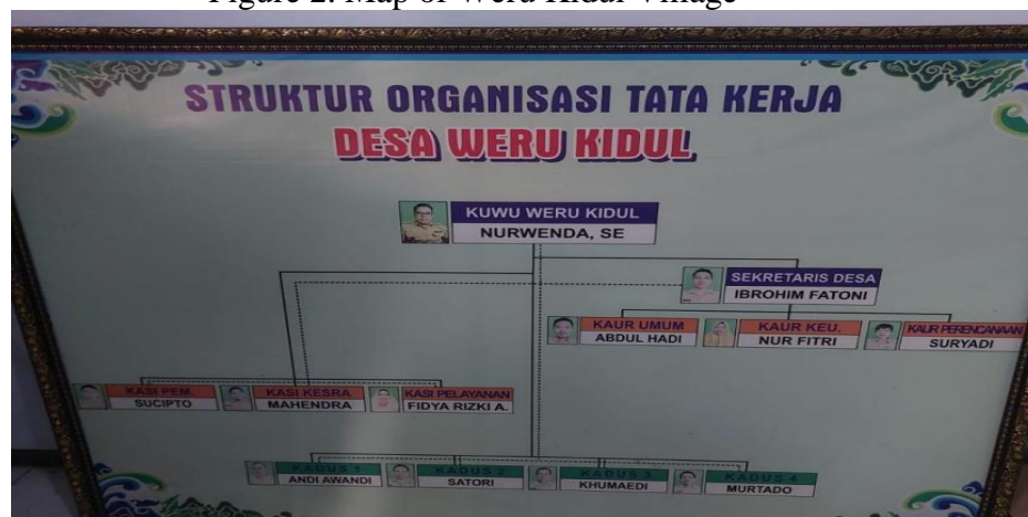
Figure 2. Weru Kidul Village Organizational Structure